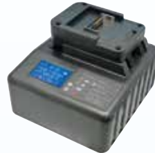
BC21L01 21 Voltage Charger Weight : 1.21kg