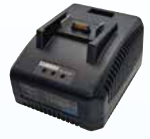
BC21L04 21 Voltage Charger Weight : 0.53kg