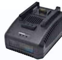
BC21L02 Weight : 0.53kg BC21L03 Weight : 0.55kg 21 Voltage Charger